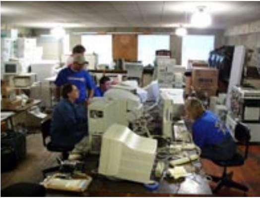
United Way "Day of Caring" volunteers recycle a small mountain of donated computer equipment, September 16.

a cover letter and project information on PLUK and the overall program. PLUK embarked on a mission to develop greater public awareness across the state several years ago, and the Christmas Appeal project is one of the newest components of the Public Awareness campaign. For more information or to assist with the Christmas Appeal Project, call PLUK's Office at 800-222-7585.