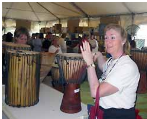
Participants will explore objects from community collections as well as from museums.

http://clast.gallaudet.edu/summer/special/enhancing.html